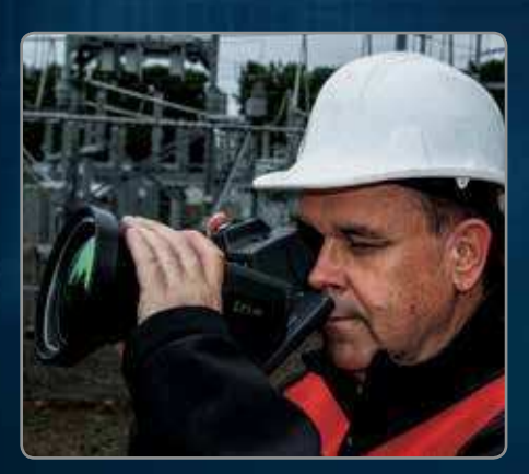
VIEWFINDER FOR BRIGHT CONDITIONS