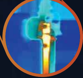
UNMATCHED RESOLUTION AND MEASUREMENT PERFORMANCE EVEN AT 8X ZOOM

FLIR's new UltraMax is a unique image processing technique that allows you to generate reports with images that have four times as many pixels, and 50% less noise, so you'll be able to zoom in on smaller targets and measure them more accurately than ever.